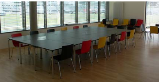
Cafeteria furniture with olé chairs and no limits tables in Würth Solar's corporate colours.

With high sales in CIS thin-film photovoltaic technology as its aim, the innovative company Würth Solar has built a new headquarter in Schwäbisch Hall. From autumn 2006, mass-produced CIS modules will be manufactured there for the first time. The bright entrance and staircase complex penetrates the office building like a wedge and features a door leading to the production plant. The corporate colours black, red and yellow are displayed by the architecture as well as by the furnishings. For the 75 workstations in administration envisaged in the first phase of construction, only furniture from Sedus was selected.