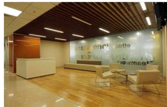
On each floor: areas for informal communication