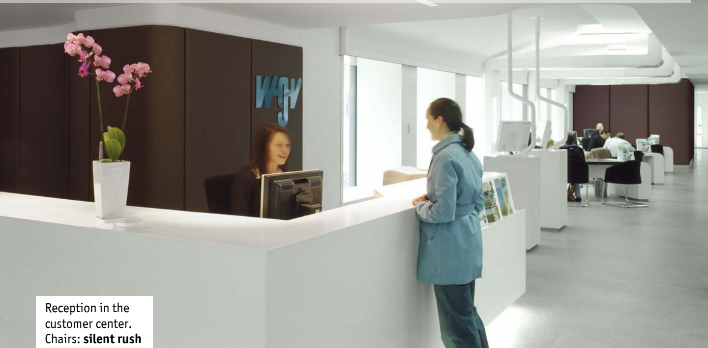
Reception in the customer center. Chairs: silent rush

Württembergische Gemeindeversicherung was established in Stuttgart in 1921. The company provides insurance cover for cities and communities as well as private persons in public service positions. For around 600 employees, a new office building was erected in the centre of Stuttgart. It was planned by architects hascher & jehle. The interior architecture of the customer centre was designed by ippolito fleitz.